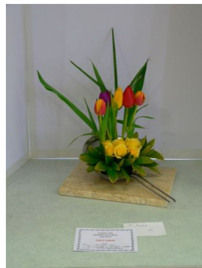
Spring No. 6