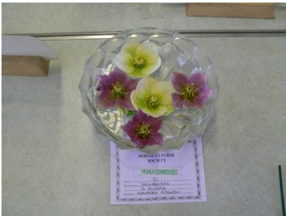
Spring No. 3