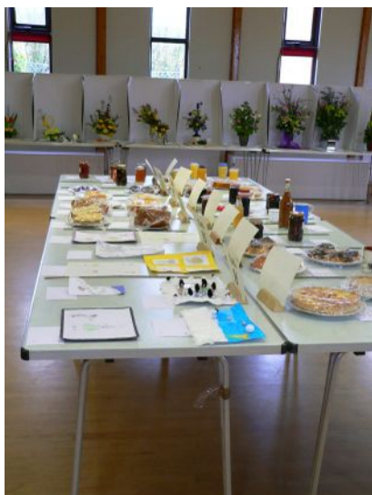
Spring No. 5