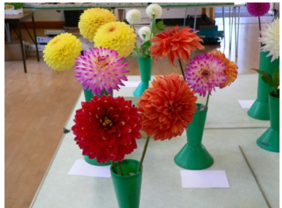
Autumn No. 2