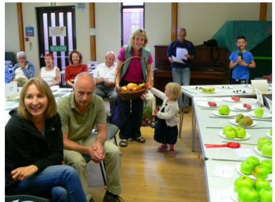
Autumn No. 4