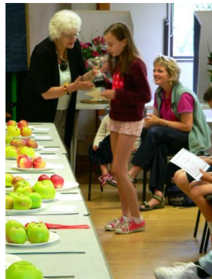
Autumn No. 6