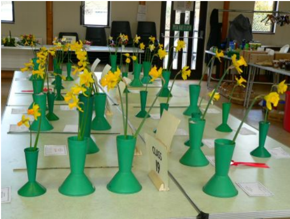
Spring No. 1