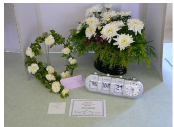
Spring No. 4