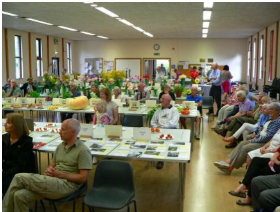
Autumn No. 3