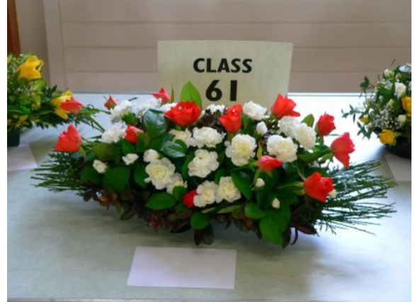
Spring No. 2