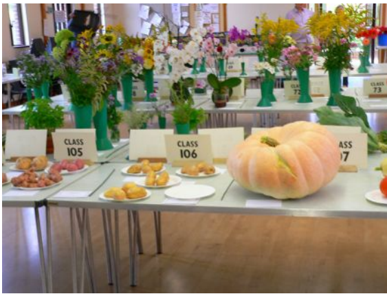
Autumn No. 1