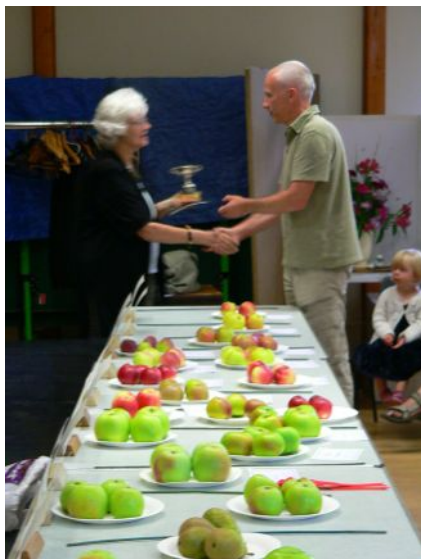
Autumn No. 5